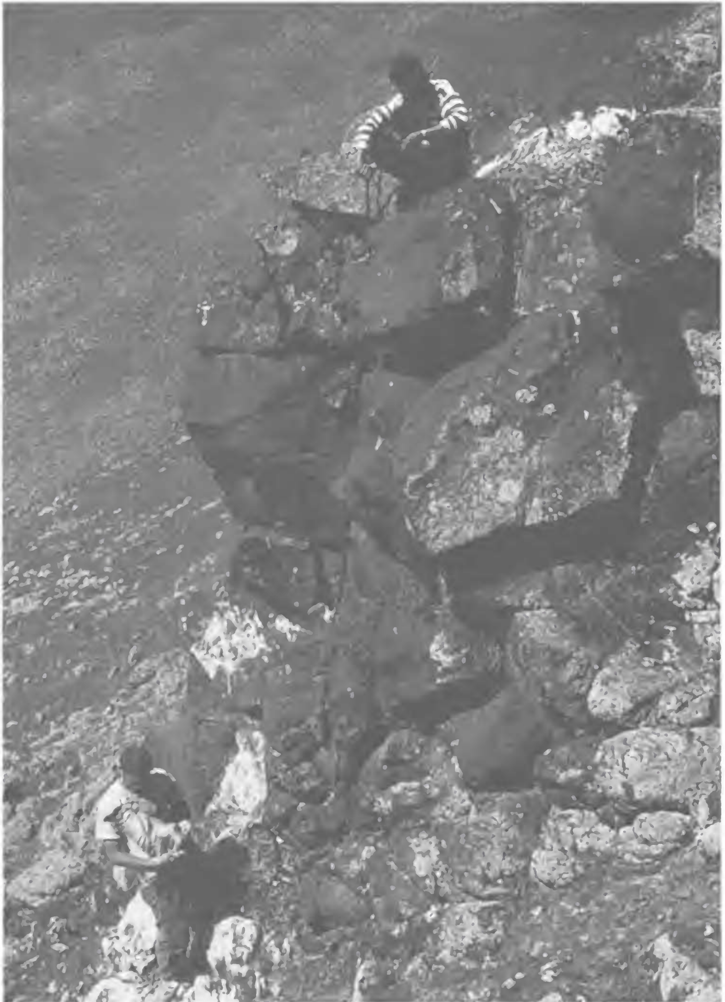
Figure 2. A cliff top Saker Falcon nest with an Upland Buzzard nest 4.4 m below.